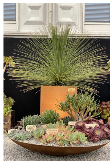
Part of the nine metre garden display featured a selection of rare succulents including the world's first Semponiums.