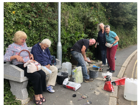
Cementing the King Charles III coronation plaque and stone's in place.

Once enough stones were gathered, they were cemented in place alongside a commemorative plaque marking the coronation of King Charles III held on the 6th of May 2023.