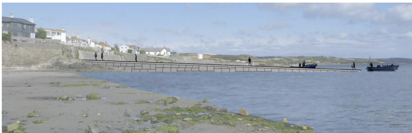
Artists impression of what the new Gwelva landing stage will look like after the completion of the rebuild which is scheduled to be done by the start of the summer

As part of this project, pupils from Marazion School are creating a time capsule to be built into the new boat landing. The children will be finding items to fill the capsule to represent life in 2023 to delight and intrigue a future generation when the Gwelva boat landing is next redeveloped.