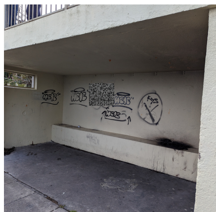
The Dollen is often vandalised despite council clean ups.