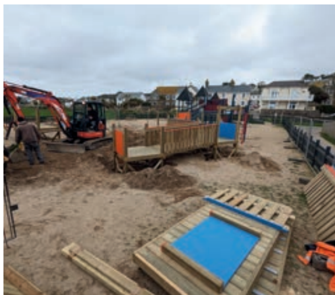
Workmen started building the new play area and 'Folly Roger' in February whilst dealing with gales and torrential rain so that it could all be ready for children come the Easter holidays

Workmen put the new equipment together in mid February so that the play area was ready for action when the weather started to be less awful in spring. On 15 April the Mayor and school children took part in a ribbon cutting for the new equipment that should last for years to come.