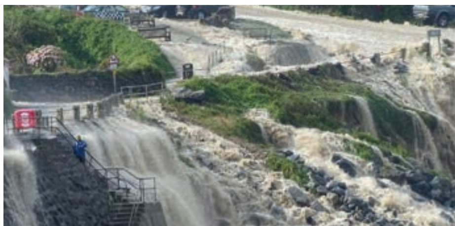
The scene in Coverack in 2017 when it experienced the heaviest rainfall ever seen in the UK. With climate change, scenes like this could become more commonplace and is why the Town Council is asking for your help