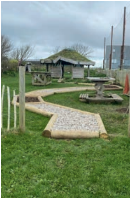
Year 6 children have come up with the ideas for the sensory path

Marazion School is creating a sensory trail/path in and around Marazion Woodland.