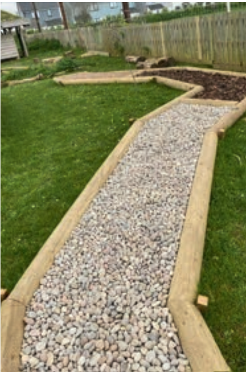
Once completed, the sensory path will be there for anyone and everyone to enjoy

This trail, when finished, will be in the woodland for the community to enjoy.