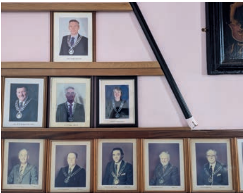
Previous Mayors from over the years look down like teachers from Harry Potters' Hogwarts School from the walls of the Town Hall meeting chamber

They want to make the town the best for all of us, so if you ever have ideas or thoughts then you can just drop them a line on their email address on the back page of this newsletter or come and meet them just before 7.30pm on the second or fourth Tuesday of every month at the Town Hall.