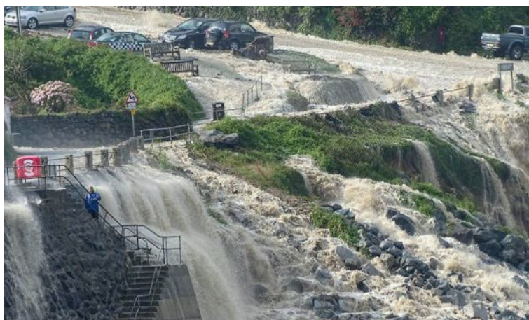
The scene in Coverack in 2017 when it experienced the heaviest rainfall ever seen in the UK. With climate change, scenes like this could become more commonplace and is why the Town Council is asking for your help